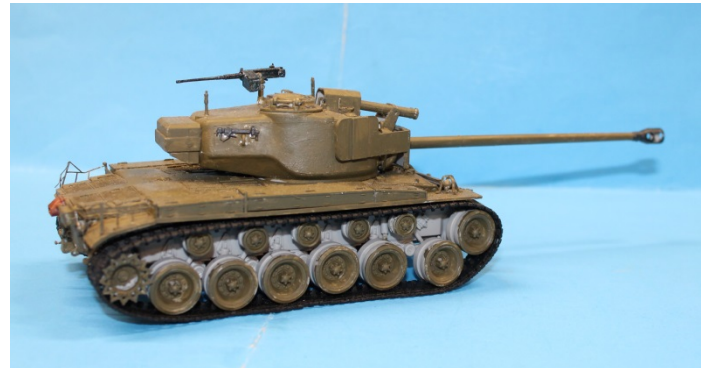
Brian Matteuzzi's 1/35 th Hobby Boss T26E4 Super Pershing Tank with rubber tracks.