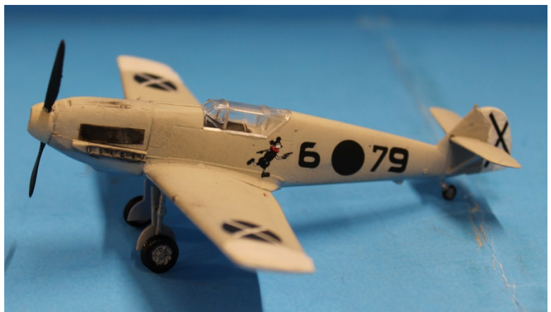
Chuck Converse converted his 1/72 nd RPM Bf-109 from an "E" to the earlier "D" model.