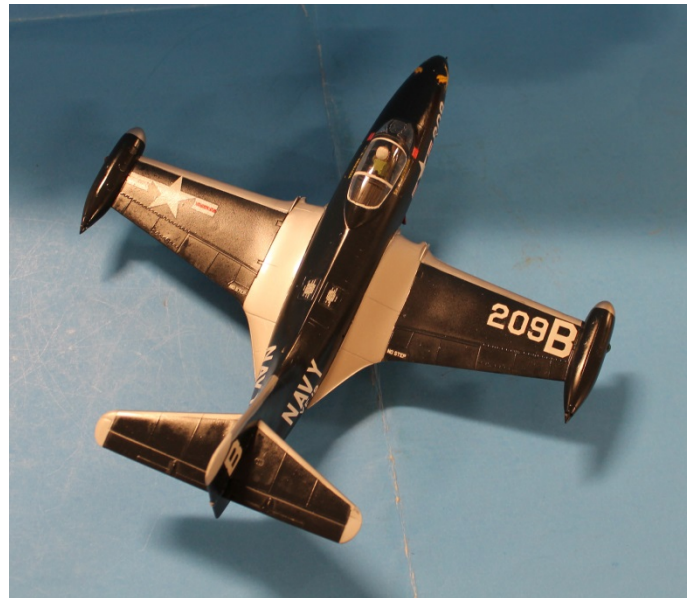
Rod Currier's 1/48 th Monogram F9F-5 Panther in markings from the movie The Bridges At Toko-Ri